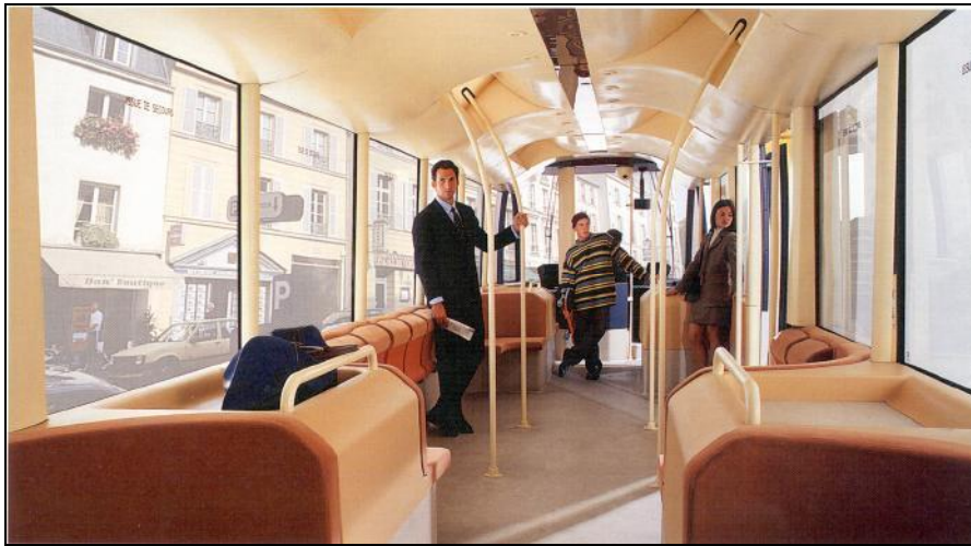
Figure 1. RapidBART proposed interior emulates the comfort and ease of rail with 3 or 4 doors that open wide and no fare collection.

The RapidBART is designed to be much faster, frequent, more comfortable, reliable and convenient than the current AirBART shuttles. It will have many similarities to rail, but using rubber tires. Much of the operational and technical information for the RapidBART proposal is based on the 2002 EIR proposal for “Quality Bus”.