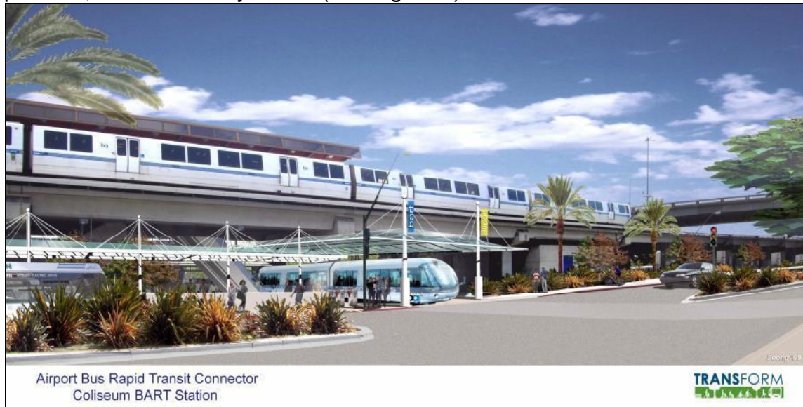
Figure 4 - The proposed Coliseum RapidBART station would be clearly marked, covered and inviting.

The Coliseum RapidBART Station would ideally be located at street level of the east end of the existing BART station, perpendicularly under the Coliseum BART Station and across San Leandro Street from the Hegenberger on-ramp. This space under the BART tracks and platform is currently vacant. There is a No Stopping zone in the curb space in this area, and the RapidBART station would be about 300 feet east of the curbside berthing area currently used by AirBART and AC Transit buses. Escalators, elevators, and stairs would link the RapidBART station directly to the east end of the BART station platform, located directly above (see Figure 3).