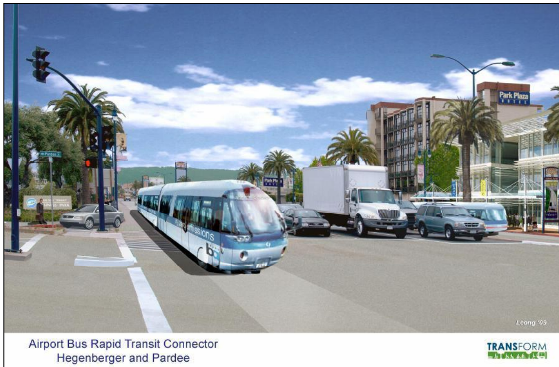
Figure 3 – Right-hand queue jump lanes would allow RapidBART to bypass traffic congestion, greatly improving speed and reliability. New stop is visible across intersection

Queue jumpers are particularly applicable along major roadways like Hegenberger, where lack of available right-of-way may preclude a continuous exclusive-busway.